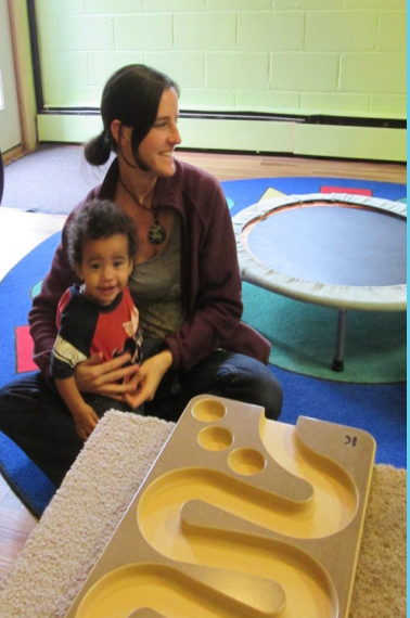
"It gives me a safe place to get out of the house when I feel depressed." —Survey comment.